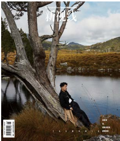
Duan Yihong in Australia