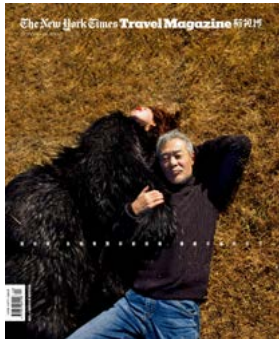
Tian Zhuangzhuang Beijing