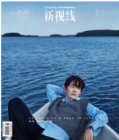
Zhu Yilong in Finland