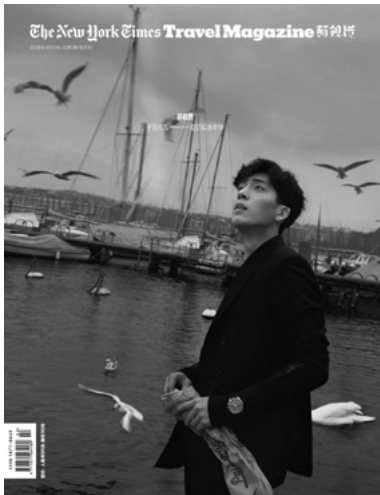
Jing Boran in Geneva

Overseas destination stories from the New York Times Travel section, Good writers from around the world are invited to tell their travel stories. New-found surprises in cosmopolitans, Detailed travel guide for less populated towns.